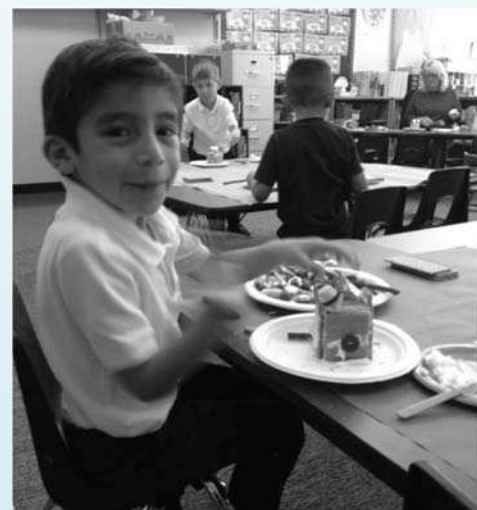
The Kindergarten Class made gingerbread houses using milk cartons and graham crackers in preparation for Christmas.