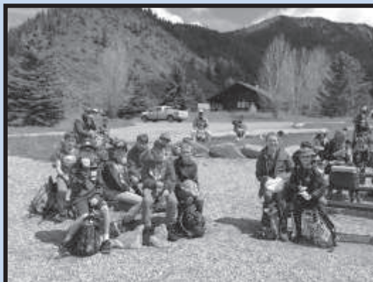
4TH GRADE TRIP TO COLORADO MONUMENT 4 DAY CAMP TRIP