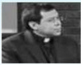
Vicario : Reverendo