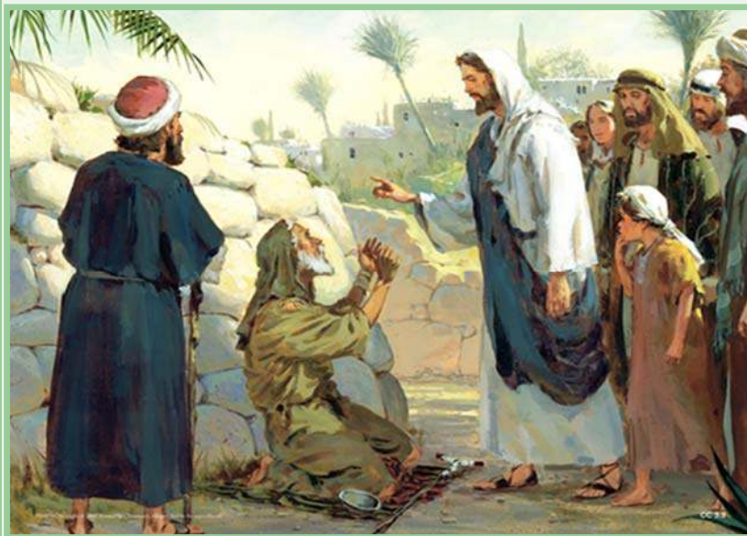
"SN. MARCOS 6, 1-6"