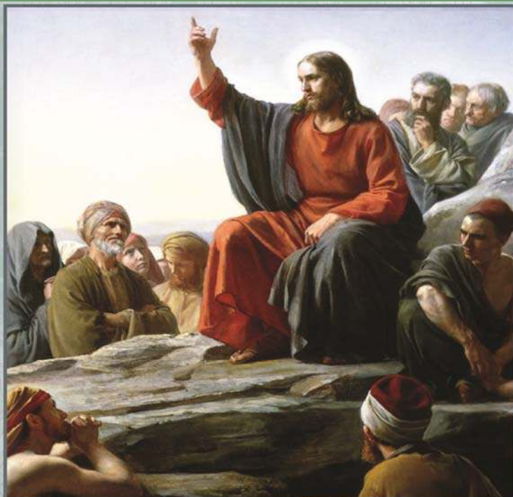
When Jesus saw that he answered with understanding, he said to him, "You are not far from the kingdom of God." - Mk 12:34ab

33 Elk Track Beaver Creek, CO 81620 P. O. Box 1390 Edwards, CO 81632