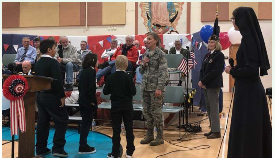
Fifth grade students asked veterans questions about their time in the service for the whole school community to learn more about life in the military.