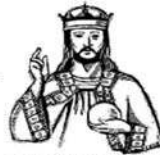
CHRIST THE KING

The puzzle is based on Luke 23:33-43 (NIV).