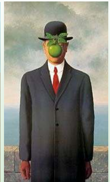
Elementary school art students have been studying the work of René Magritte. They had a chance to recreate one of his famous paintings. Can you guess who is behind the fruit?