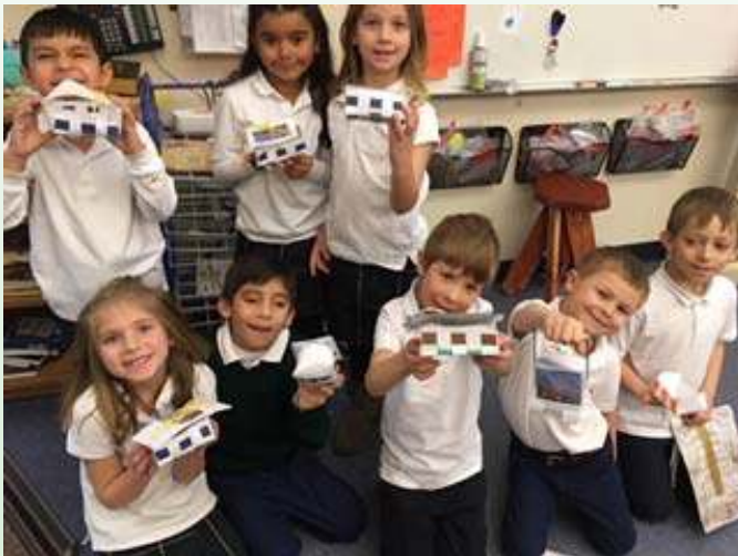
1st grade students learned about the story of Moses and wove baskets for baby Moses.